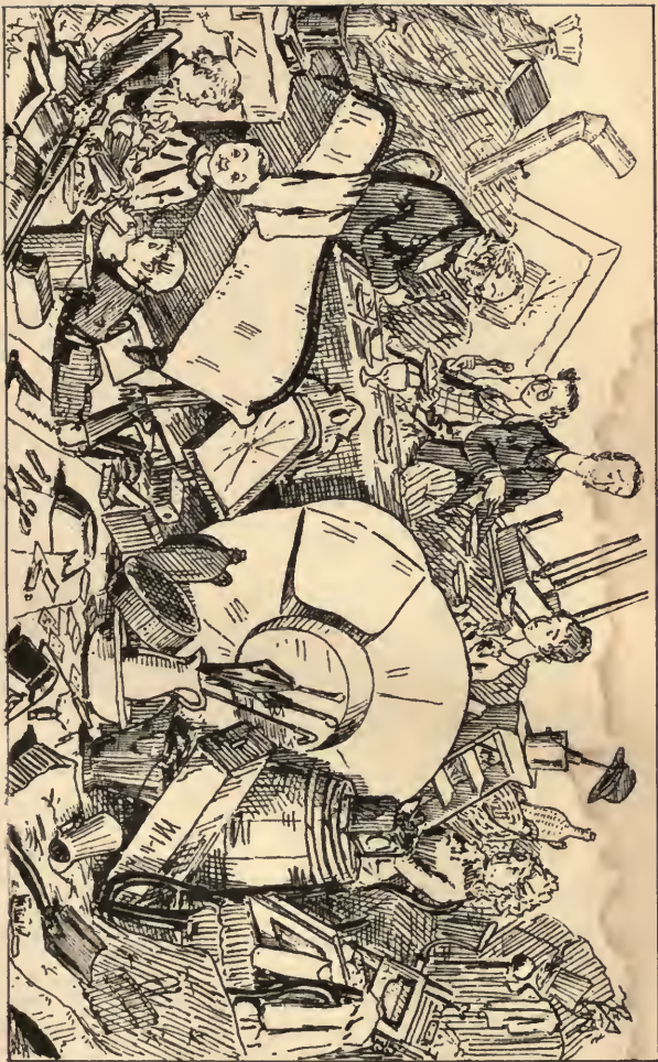
The Seterkins are moved.